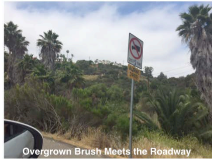
Overgrown Brush Meets the Roadway