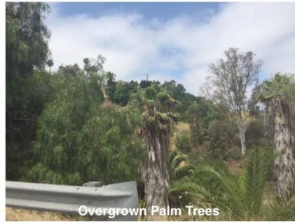
Overgrown Palm Trees